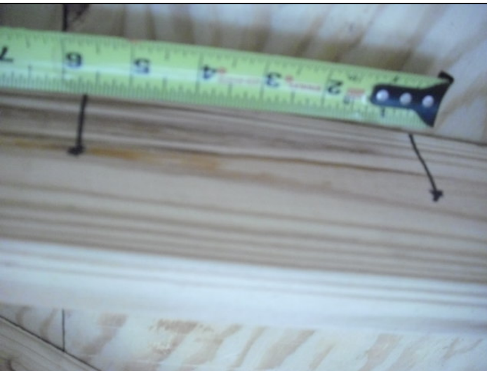
Roof deck attachment