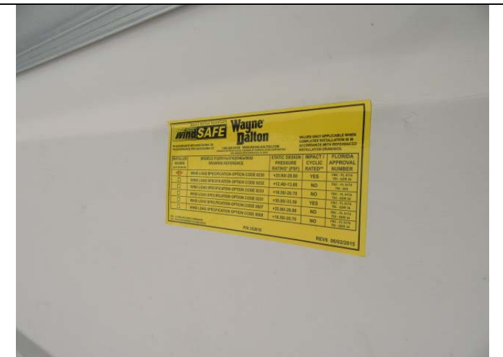
Garage door data