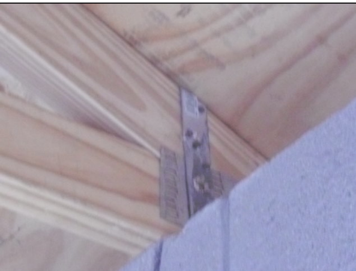
Roof to wall attachment