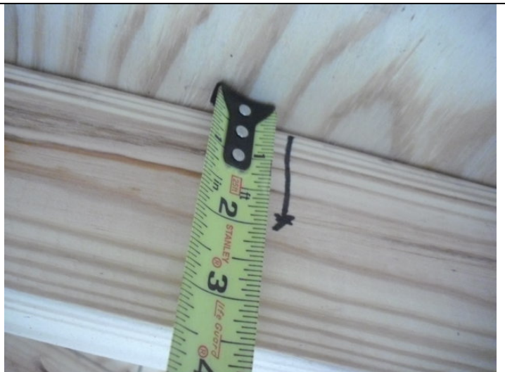
Roof deck attachment