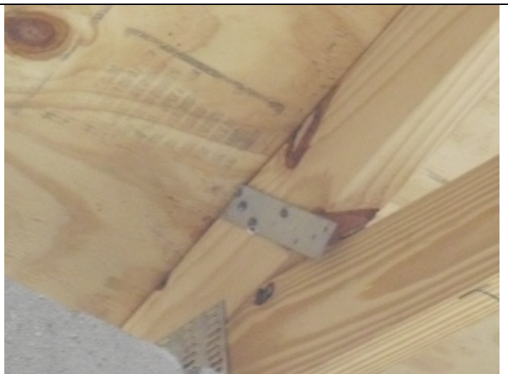
Roof to wall attachment